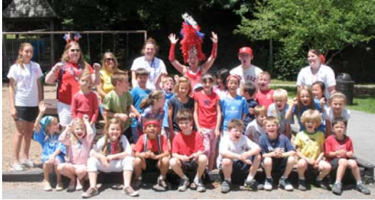
The Beginning Readers 2010