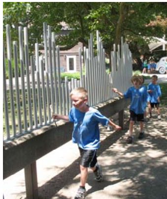
The Musical Fence at DeCordova Museum