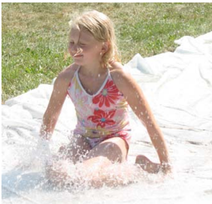
Beating the heat on the Slip & Slide

What a difference a year makes. At this time last summer we were wearing fleece jackets and rain boots. This week has seen temperatures consistently in the 90's with high humidity. Hydration has been the focus this week with teachers, tutors and counselors all encouraging students to drink water throughout the day. Parents should make sure their students have a refillable water bottle each day. There are plenty of coolers on campus for staff and students to access.